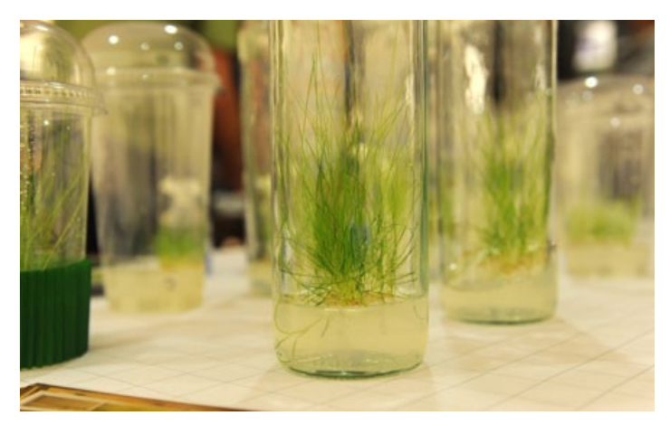
"Pasture To Go" / Copyright: Klaus Fritze

Artist Klaus Fritze created in vitro plants together with participants at an experimental research station with the help of a Bunsen burner, a disposable cup and several seeds of grass.